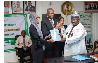
MoU signed and sealed