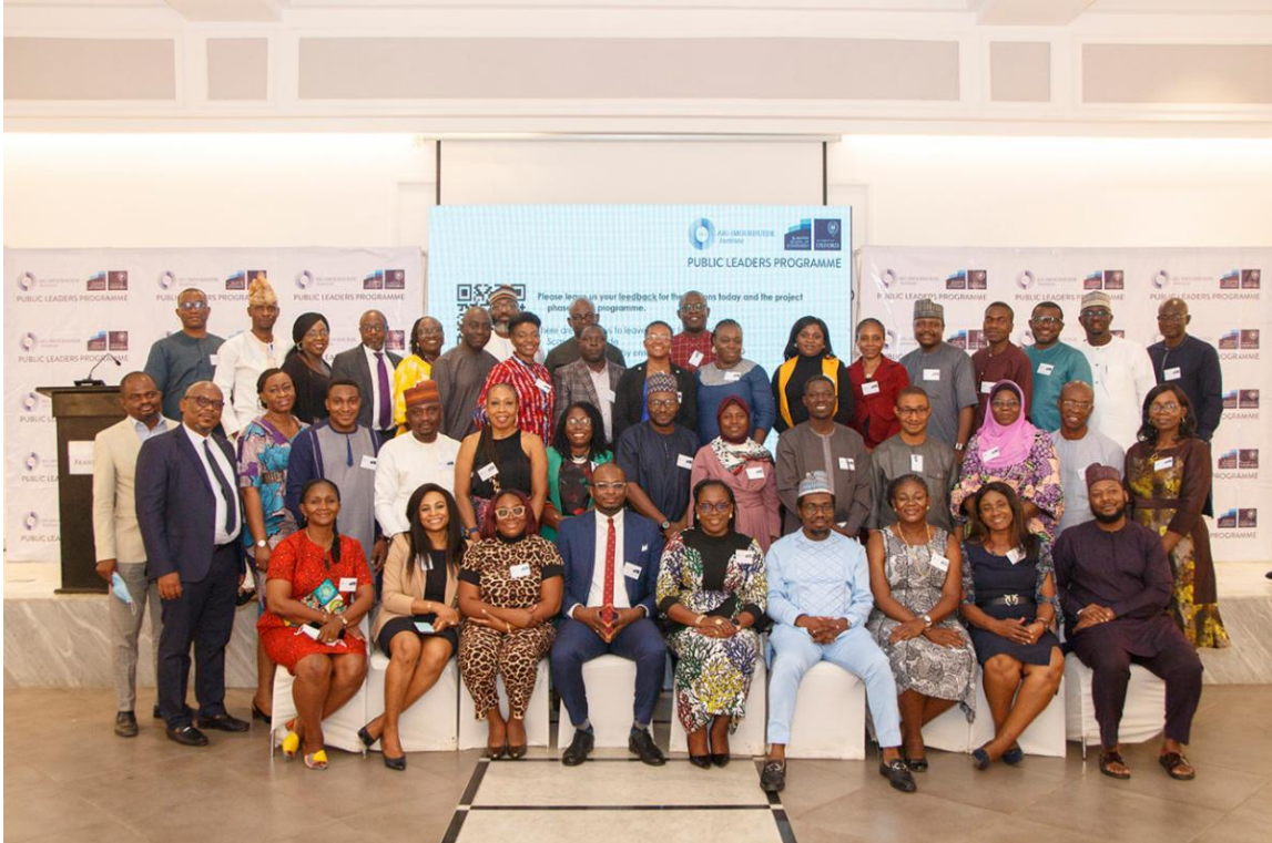
AIG Public Leaders Programme Class of 2021

The second residential week of the AIG Public Leaders Programme took place in Abuja last month. Participants reflected on the different teaching modules they had engaged in over the course of the programme and shared their experiences on how they have applied the techniques and new skills they learned to their day-to-day activities in their work.