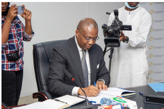
Aigboje Aig-Imoukhuede Chairman Aig-Imoukhuede Foundation, witnessing the MoU signing

The signing of the agreement marks the long-term commitment of both organisations to work collaboratively to develop the Index and ensure its success.