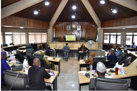
Cross-section of Federal Permanent secretaries

As part of our partnership with the Office of the Head of the Civil Service of the Federation (OHCSF), the Aig-Imoukhuede Foundation organised communication training sessions for Federal Permanent Secretaries. The training sessions were focused on helping participants develop and communicate key messaging for the work of their departments.