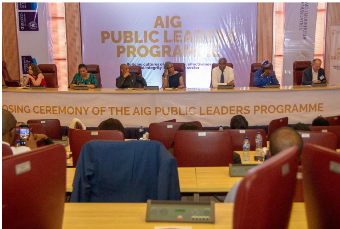
The panel of judges commenting on the capstone projects developed by the class.

Details of the five top-rated projects developed by the class and their impact are provided below.