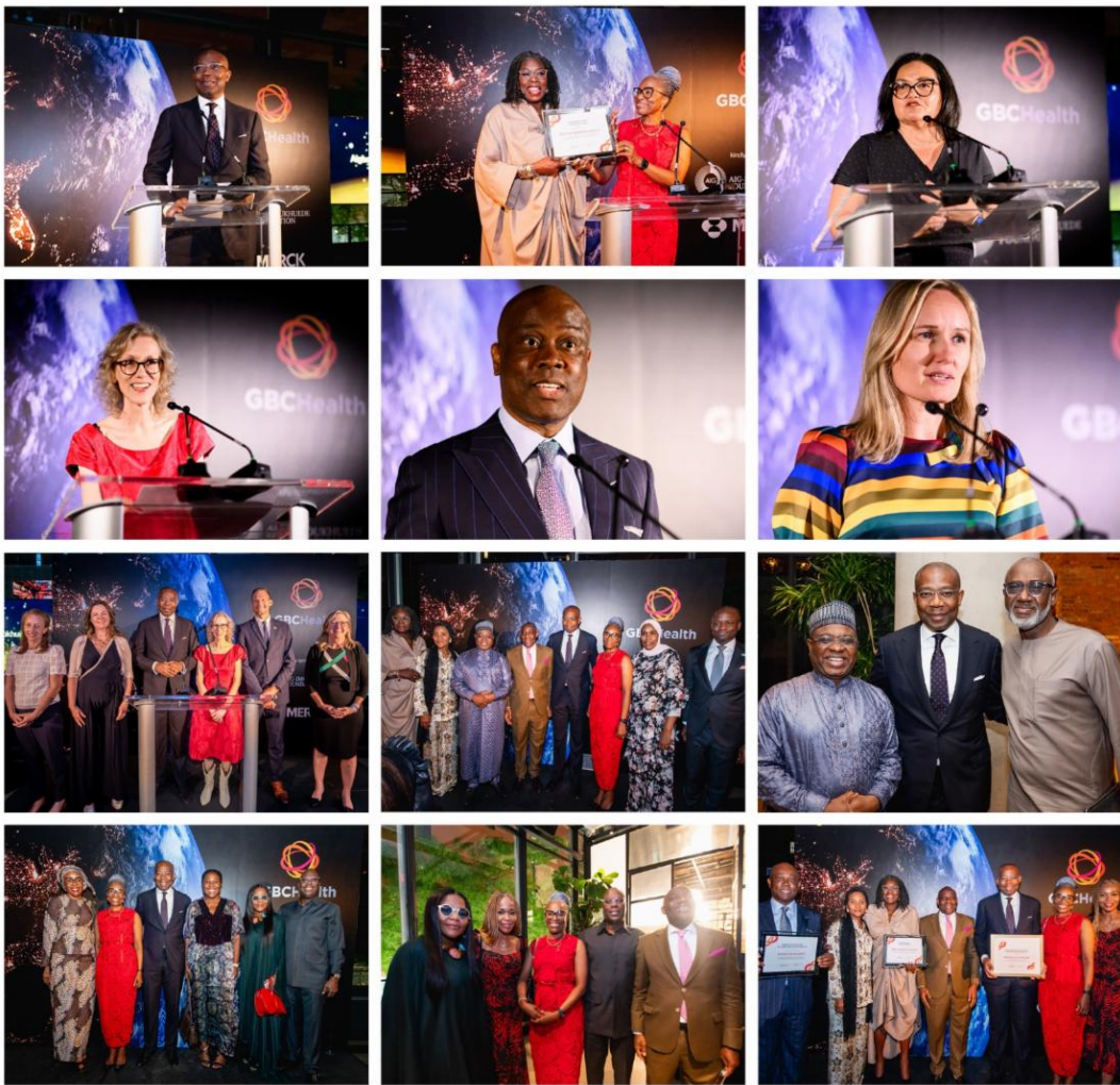
Introducing the class of the 2023/2024 AIG Public Leaders Programme